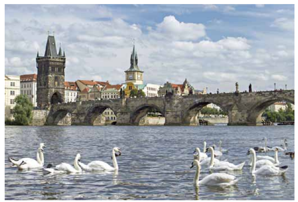
Charles Bridge, Prague