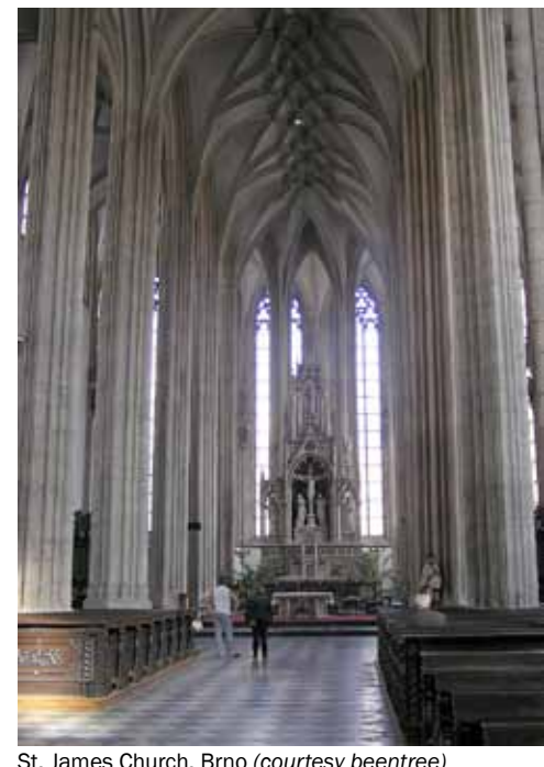
St. James Church, Brno

After breakfast, you leave Prague for Brno (pronounced bur-No), the second-largest city in the Czech Republic. If the group is in town before 11 a.m., the first stop will be in Freedom's Square to see the city's unusual astrological clock. Daily this clock drops one marble out of one of its four openings. Many locals come to the clock on a regular basis to see if they can add to their marble collection. Then, after a break for lunch, a local guide will join you for a TOUR OF THE CITY'S UNDERGROUND NETWORKS. On this tour you'll visit the LABYRINTH UNDER THE CABBAGE MARKET, where local business and families kept their goods, the MINTMAKER'S CELLAR, where coins were produced, and the OSSUARY UNDER ST. JAMES CHURCH, an underground cemetery. Leaving town, Špilberk castle watches over the city from its hill. We then continue our drive, crossing back into Austria, and head to a hotel near the airport. This evening we gather for a farewell dinner. (B, D)