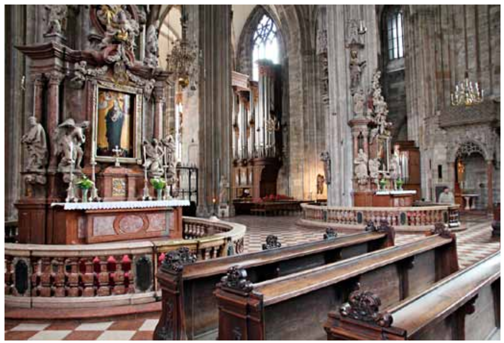
St. Stephens Cathedral, Vienna

It's time! Time to board a bus for Chicago and start our concert tour. In Chicago we check in for the nonstop flight to Vienna. Europe here we come! #YOLO (D-in-flight)